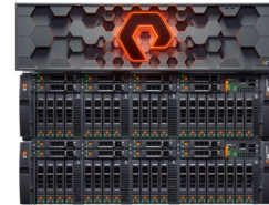
FIGURE 2: FlashArray//C60 capacity scaling